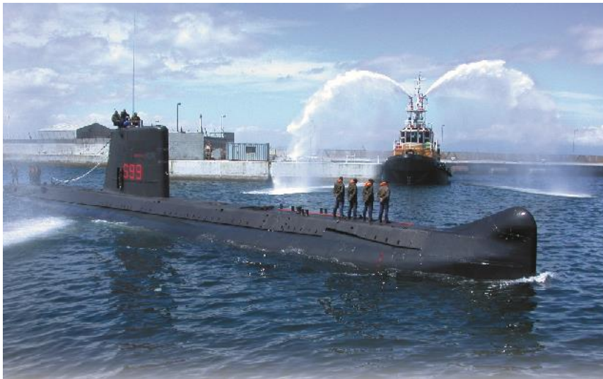
SAS Assegai's final alongside in 2003

On 23 November 2003, the last of the SA Navy's Daphne class submarines, SAS Assegai (ex- Johanna van der Merwe ) was paid off for the last time and destined for disposal along with her two sisters. With the scrapping of our first submarine, SAS Spear (ex- Maria van Riebeeck ) that same year, a number of naval enthusiasts, both serving and retired, however, felt that she should be preserved as a museum vessel and campaigned for her retention.